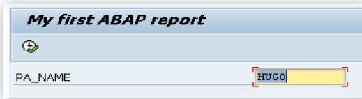
Figure 2.1: A parameter as an input variable

The parameter serves as an input field and as a variable.